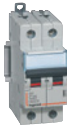
4 078 02